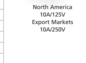
North America 10A/125V Export Markets 10A/250V