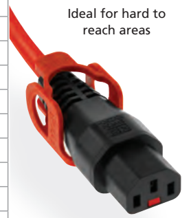
Ideal for hard to reach areas