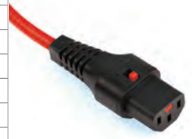
North America 10A/125V Export Markets 10A/250V